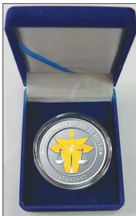
Obverse of the Hutt River Principality "Dual Celebration Commemorative" bearing the Hutt River Principality's crest.