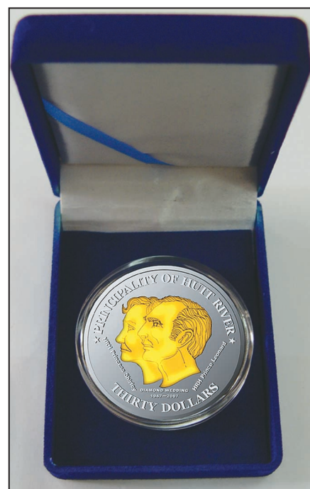
Reverse of the Hutt River Principality "Dual Celebration Commemorative" bearing effigies of Prince Leonard and Princess Shirley